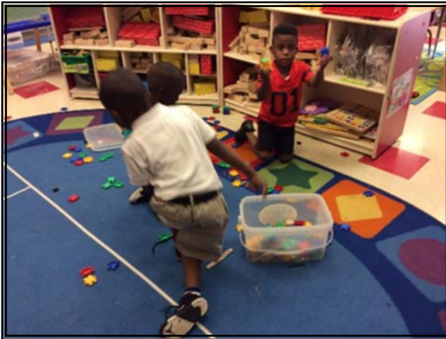
Children enjoying classroom activities.